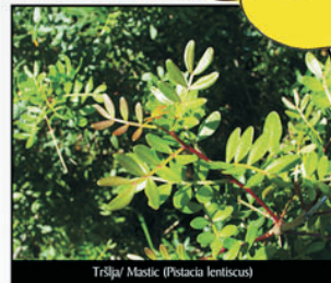
Tršlja/ Mastic ( Pistacia lentiscus )