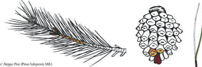
Alepski bor/ Aleppo Pine ( Pinus halepensis Mill.)

Zrak Park-šume tijekom godine ispunja ugodan miris isparavanja četinjača i vazdazelenog raslinja, što se osobito pojačava u svibnju kad cvjetaju brnistra ( Spartium junceum ) i pitosporum ( Pittosporum tobira ). Florna bogatstvo Komrčara izraženije je na njegovoj osunčanoj, prisojnoj padini, uz Obalno šetalište fra Odorika Badurine, jer se ovdje nalaze raznolikija staništa nego u sjenovitoj unutrašnjosti šume. Tu rastu agave ( Agave americana ) koje pridonose egzotičnom ozračju ovog dijela Park-šume. Vršni dijelovi grebena i osojna strana sjenoviti su jer tamo raste uglavnom sklopljena šuma hrasta crnike ( Quercus ilex ). Osim ptica, od faune zanimljiv je leptir kleopatrin žučak ( Gonepteryx cleopatra ), tipičan predstavnik sredozemne faune.