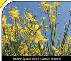
Brnistra/ Spanish broom ( Spartium junceum )