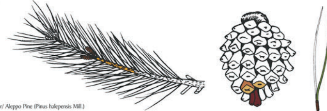
Alepski bor/ Aleppo Pine ( Pinus halepensis Mill.)

Zrak Park-šume tijekom godine ispunja ugodan miris isparavanja četinjača i vazdazelenog raslinja, što se osobito pojačava u svibnju kad cvjetaju brnistra ( Spartium junceum ) i pitosporum ( Pittosporum tobira ). Florna bogatstvo Komrčara izraženije je na njegovoj osunčanoj, prisojnoj padini, uz Obalno šetaliste fra Odorika Badurine, jer se ovdje nalaze raznolikija staništa nego u sjenovitoj unutrašnjosti šume. Tu rastu agave ( Agave americana ) koje pridonose egzotičnom ozračju ovog dijela Park-šume. Vršni dijelovi grebena i osojna strana sjenoviti su jer tamo raste uglavnom sklopljena šuma hrasta crnike ( Quercus ilex ). Osim ptica, od faune zanimljiv je leptir kleopatrin žučak ( Gonepteryx cleopatra ), tipičan predstavnik sredozemne faune.