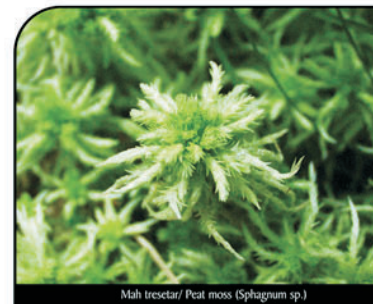
Mah tresetar/ Peat moss (Sphagnum sp.)