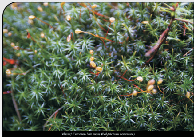
Vlasac/ Common hair moss (Polytrichum commune)

Projekt revitalizacije creta s močvarnim zmijincem započeo je 2009. godine donacijom Zaklade Tomo Hovatinčić. / The project to revitalize the mire with bog arum was started in 2009 with a donation by the Tomo Hovatinčić Foundation.