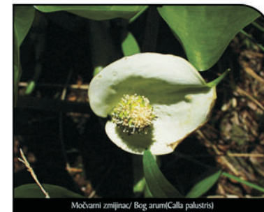
Močvarni zmijjinac/ Bog arum (Calla palustris)

There are only a few places in the Gorski kotar area where we can find dark coniferous forests related to those in the far north (boreal taiga-type forests). One such place is located north-west of the village of Sunger - the magical coniferous fir and spruce forest of Sungerski lug. This forest features numerous small depressions similar to sinkholes, some of which represent small transition mires. These depressions are often flooded in spring, but mostly dried up in summer. Some of them are overgrown with peat moss (Sphagnum spp.), which soaks up significant amounts of water like a sponge, making this habitat permanently moist, enabling the survival of some of the rarest plant species in Croatia.