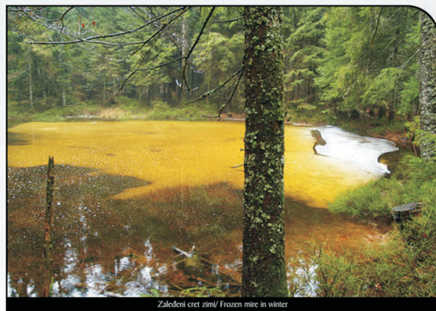
Zaleđeni cret zimi/ Frozen mire in winter

Na svega nekoliko mjesta u Gorskom kotaru možemo doživjeti tamne crnogorične šume srodne šumama dalekog sjevera (borealne šume tipa tajge). Sjeverozapadno od sela Sunger jedno je od takvih mjesta - bajkovita crnogorična šuma smreka i jela Sungerski lug. U šumi su kao svojevrsna zanimljivost brojna manja udubljena nalik ponikvama, od kojih neka predstavljaju male prijelazne cretove. Udubljena su u proljeće često poplavljena, a ljeti voda uglavnom presuši. Neke od njih obrasta mah tresetar (Sphagnum spp.) koji poput spužve (»sunger«) upija znatne količine vode, čineći stanište stalno vlažnim i omogućujući preživljavanje nekih od najrjeđih biljnih vrsta Hrvatske.