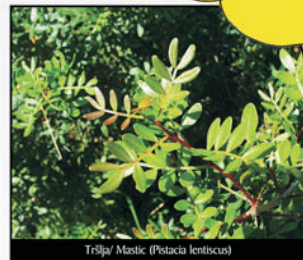
Tršlja/ Mastic ( Pistacia lentiscus )