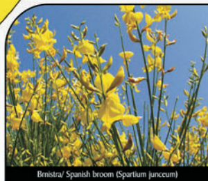
Brnista/ Spanish broom ( Spartium junceum )