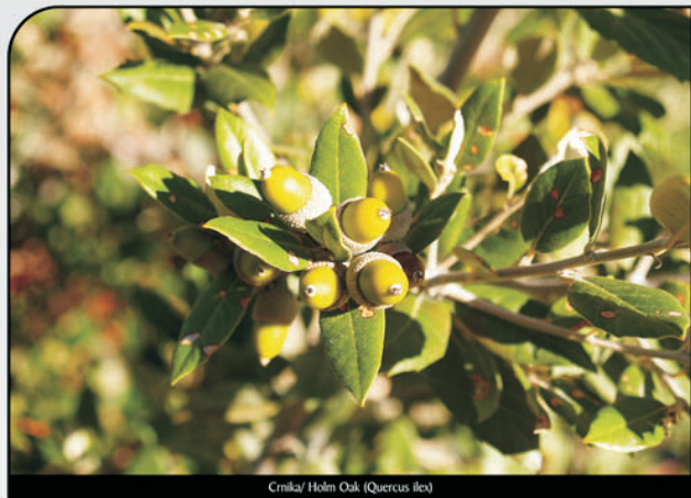
Crnika/ Holm Oak ( Quercus ilex )

HRV GODINA PROGLAŠENJA: 1965. NADMORSKA VISINA: oko 0 - 40 m