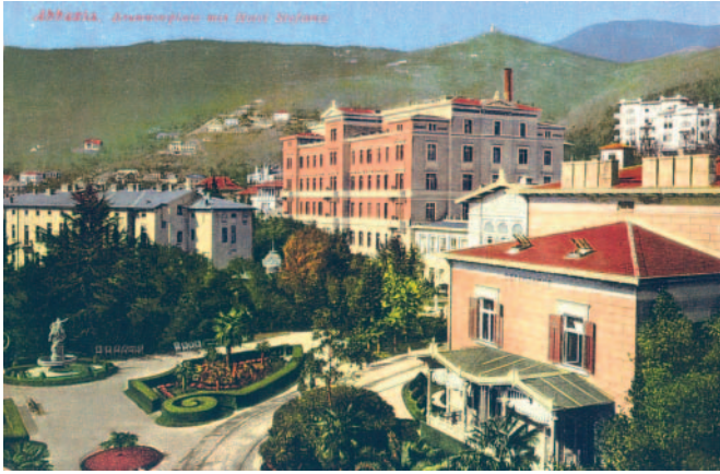
Figure 6. Sv. Jakov Park in the beginning of the 20 th century

tion is also the protection of monuments of park architecture, according to the Law – and the unit of local government – the Town of Opatija, who officially started the initiative for protecting this Park. It is important to point out that the whole procedure is regulated by the two County institutions: County Department for Civil Engineering and Environmental Protection and Public Institution for Managing Protected Nature Areas Priroda. Also, it is important to mention that during the procedure of putting the Sv. Jakov Park under protection a public appraisal was opened in the Registry Office of the Town of Opatija from April 19, till May 20, 2010. where interested parties were invited to write their comments and opinions. The public appraisal ended successfully so finally, on November 18, 2010. the Assembly of Primorsko-Goranska County declared the protection. The Act of protection was published in Official Gazette and in the Gazette of Primorsko-Goranska County on November 24, 2010.