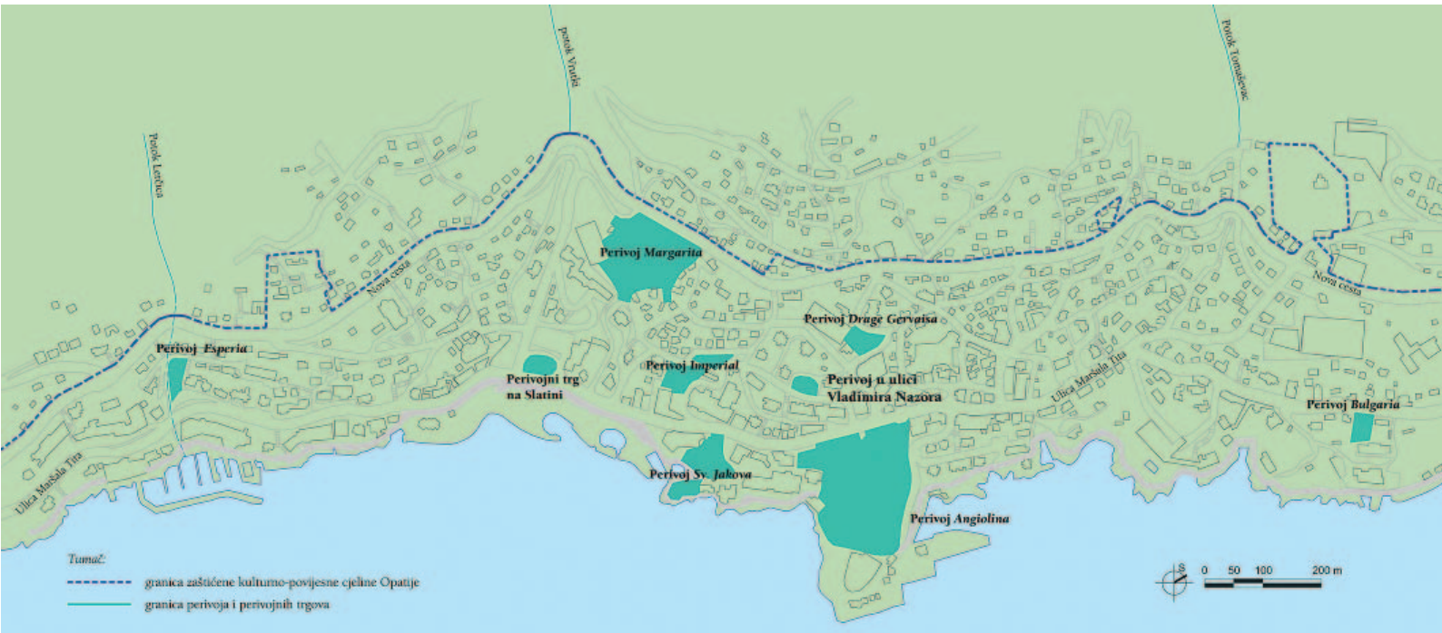
Figure 5. Nine public parks in Opatija