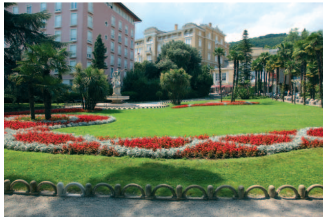
Figure 3. Sv. Jakov Park