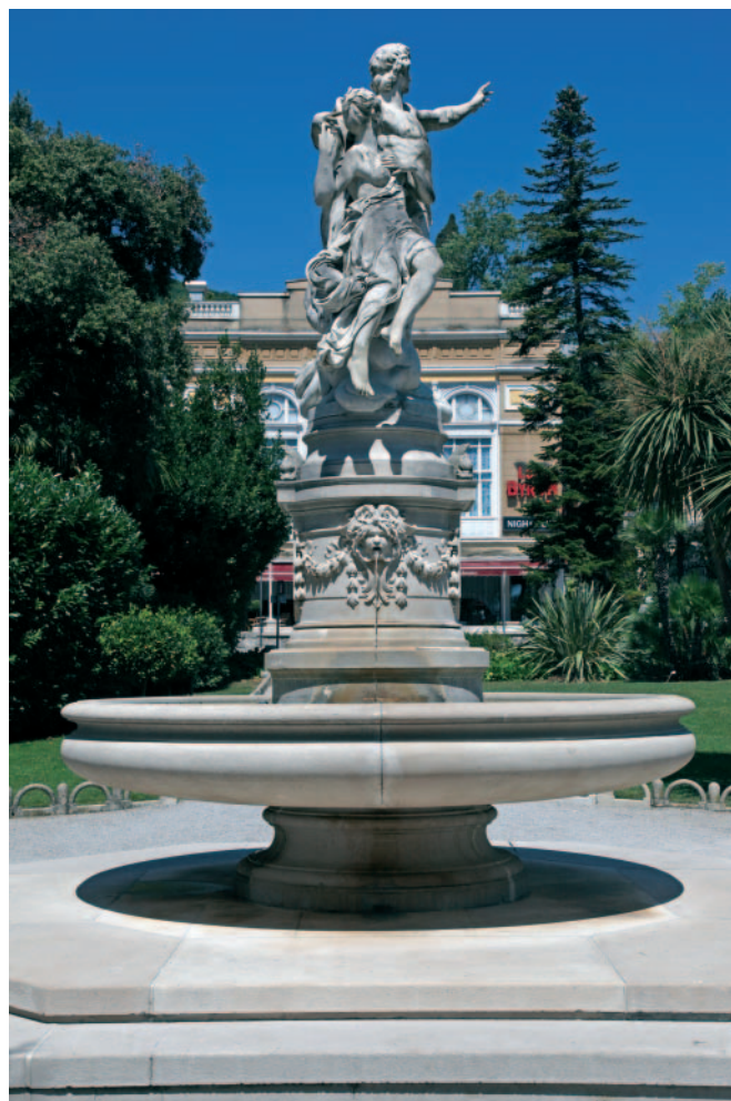
Figure 4. The neo-baroque fountain by Hans Rathausky