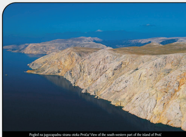
Pogled na jugozapadnu stranu otoka Prvića/ View of the south-western part of the island of Prvić

CATEGORY OF PROTECTION: special reserve; botanical-ornithologica; AREA: 7.000 ha (part of the surface comprises the surrounding waters); LOCATION: area of the Municipality of Baška (island of Krk)