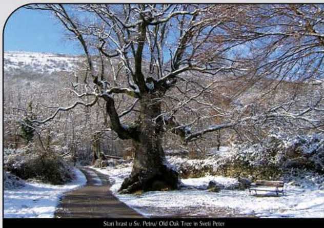
Stari hrast u Sv. Petru / Old Oak Tree in Sveti Petar

Grivka 4, 51000 Rijeka tel.: 00385/51/352400; fax: 00385/51/352401 e-mail: info@ja-priroda.hr; www.ja-priroda.hr