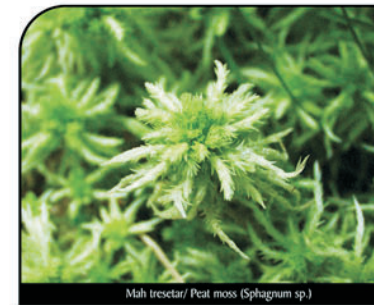
Mah tresetar/ Peat moss (Sphagnum sp.)