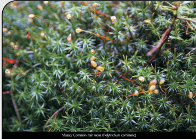
Vlasac/ Common hair moss (Polytrichum commune)

■ Projekt revitalizacije creta s močvarnim zmijincem započeo je 2009. godine donacijom Zaklade Tomo Hovatinčić. / The project to revitalize the mire with bog arum was started in 2009 with a donation by the Tomo Hovatinčić Foundation.