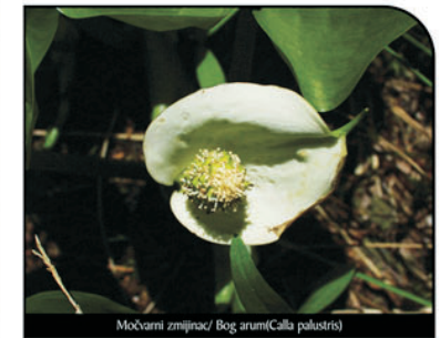
Močvarni zmijinac/ Bog arum (Calla palustris)

There are only a few places in the Gorski kotar area where we can find dark coniferous forests related to those in the far north (boreal taiga-type forests). One such place is located north-west of the village of Sunger - the magical coniferous fir and spruce forest of Sungerski lug. This forest features numerous small depressions similar to sinkholes, some of which represent small transition mires. These depressions are often flooded in spring, but mostly dried up in summer. Some of them are overgrown with peat moss (Sphagnum spp.), which soaks up significant amounts of water like a sponge, making this habitat permanently moist, enabling the survival of some of the rarest plant species in Croatia.